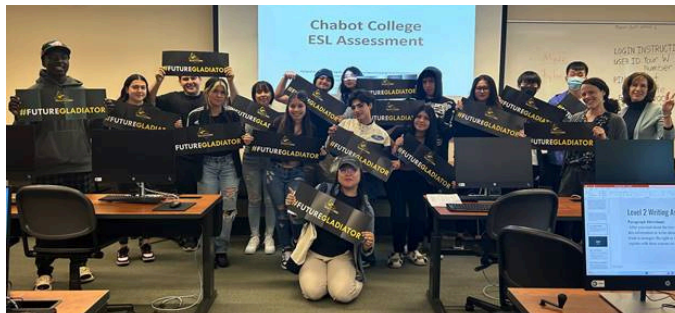
SLz EL students visit Chabot

Chabot's partnership with Sutter Health and TRIO Talent Search (a federally funded program to support students going to college) helped fund opportunities to support non A-G high school seniors who aspired to attend college. This included a field trip in January to Chabot/Cal State East Bay for 120 San Lorenzo High students, after-school tutoring, and push-in support.